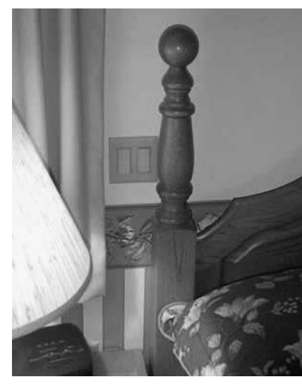
Rocker light switches reachable from the bedside, located 36" to 40" above the floor.