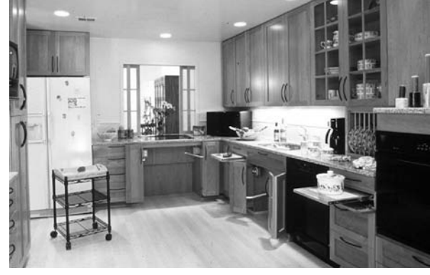
This kitchen provides ample work space, a raised dishwasher and lowered cooking surfaces.

If you love to cook, but find it difficult to bend over, or if you have a height limitation, there are numerous steps you can take to modify your kitchen to make it more "user-friendly," such as: