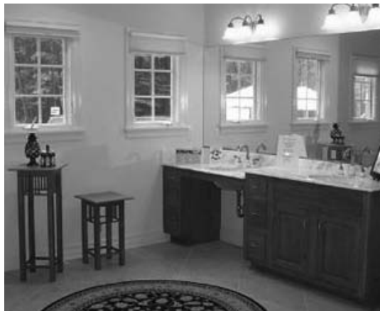
Example of ample maneuvering clearance, lowered sink with knee clearance and proper lighting.