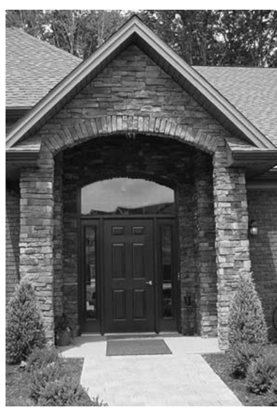
Example of a no-step, or barrier-free, entryway

Barrier-free entryways make it easier for a family member or friend who uses a wheelchair, or a grandchild who's on crutches because they've broken a leg or twisted an ankle, to gain access to your home.